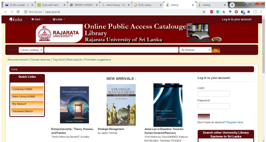
Figure 1: Library Catalog Entry Page