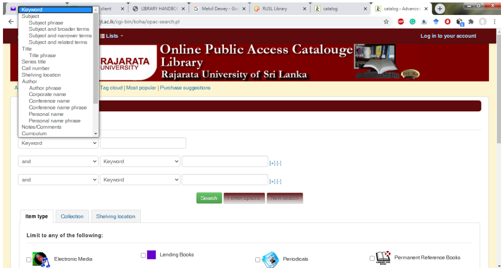
Figure 3: Available Search Fields